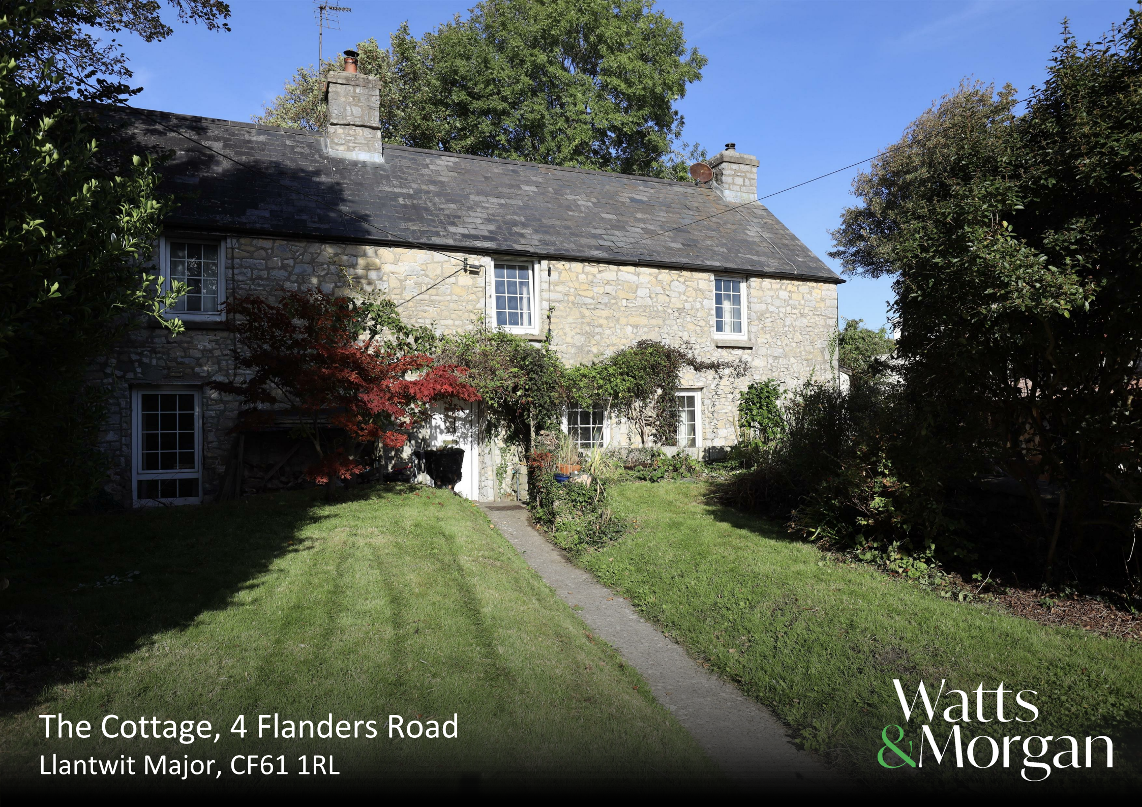
The Cottage, 4 Flanders Road Llantwit Major, CF61 1RL